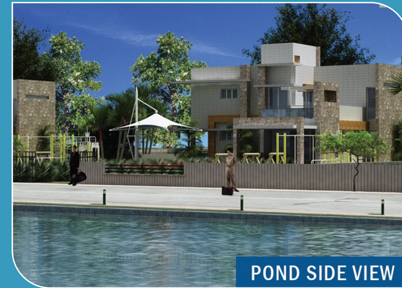
POND SIDE VIEW